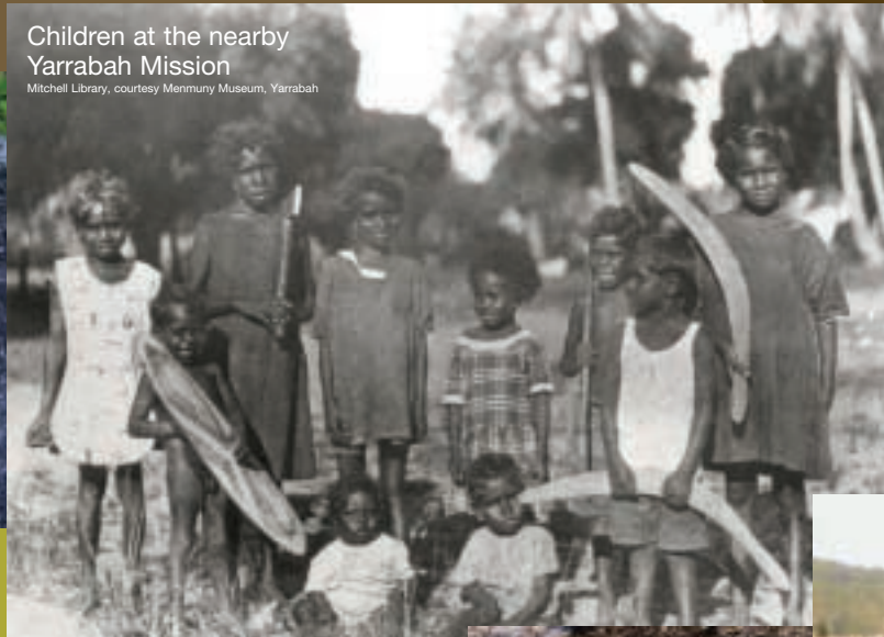
Children at the nearby Yarrabah Mission