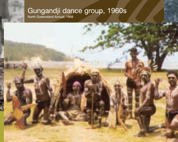
Gungandji dance group, 1960s North Queensland Annual, 1968