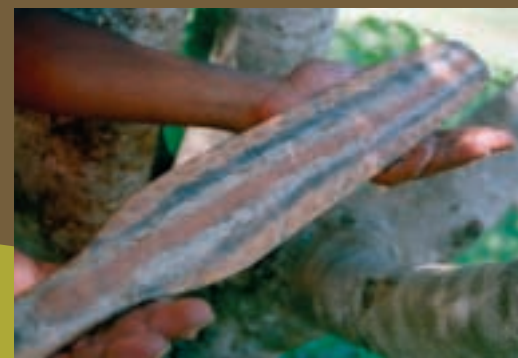
Ceremonial paddle Menzies Museum, Yarrabah