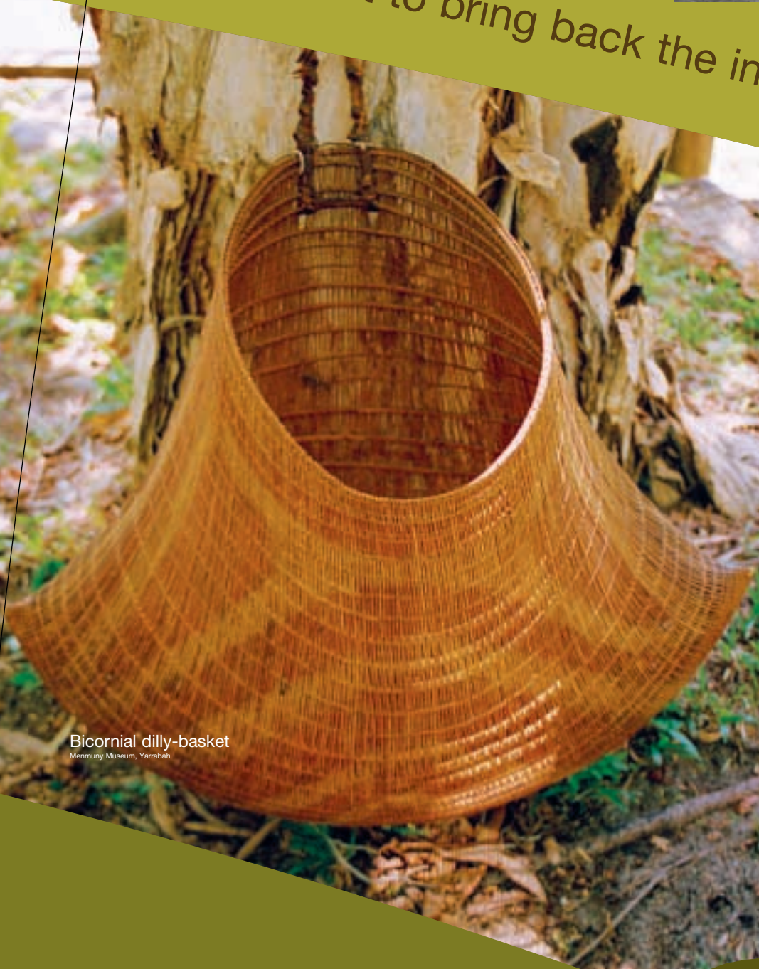
Bicornial dilly-basket Menzies Museum, Yarrabah

“We want to bring back the initiation ceremony to make the kids feel good about themselves; learn about their language, dance and stories – their identity.” Bob Patterson, Gungandji Elder