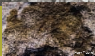
Shell-handled spear thrower Menzies Museum, Yarrabah