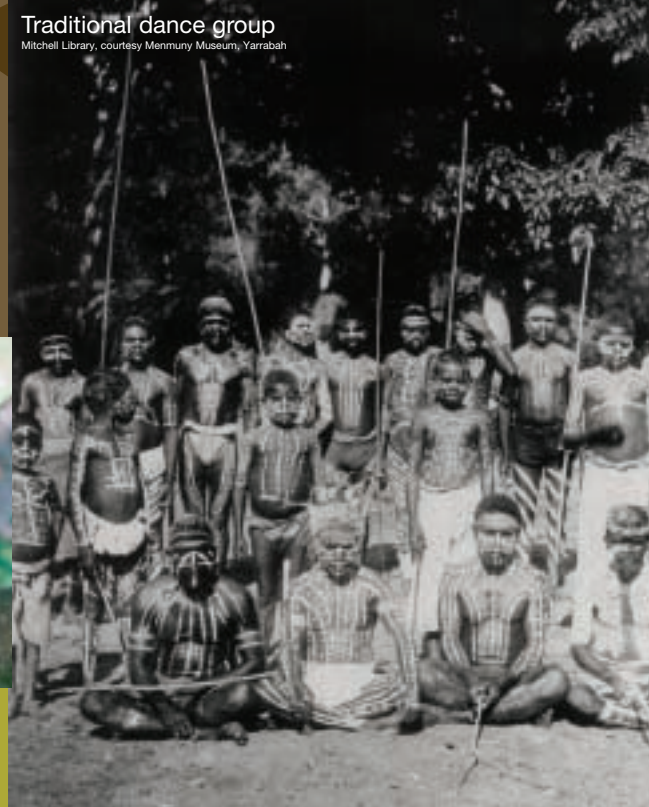
Traditional dance group Mitchell Library, courtesy Menzies Museum, Yarrabah