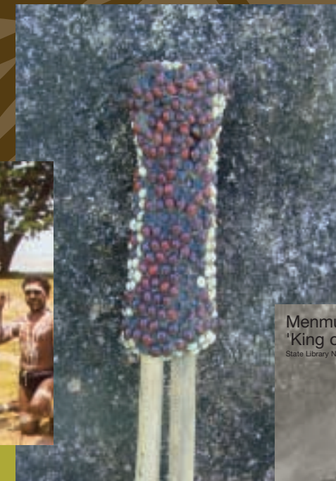
Firesticks holder Menzies Museum, Yarrabah