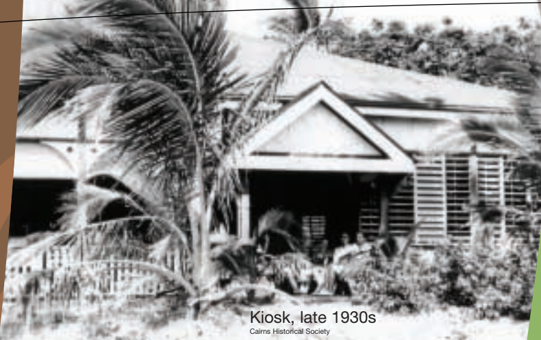
Kiosk, late 1930s

Source: Cairns North Queensland Guide Book, Winter Tours, 1933