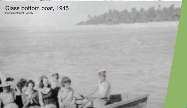
Glass bottom boat, 1945