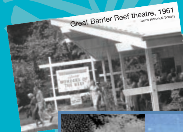
Great Barrier Reef theatre, 1961