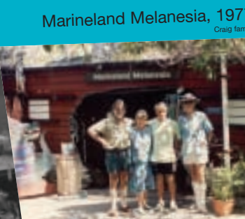
Marineland Melanesia, 1977 Cairns Weekly