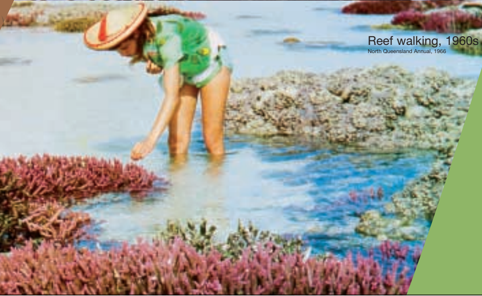
Reef walking, 1960s North Queensland Annual, 1966